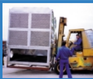
Riggers prepare to install an air-to-air stainless steel heat recovery system for a spray dryer in Leuven, Belgium.