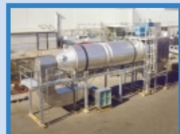
Rotary dryer for drying granulated sugar for powdered juice product in Manila, Philippines.