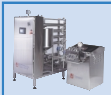
RO membrane system concentrates albumen, milk, etc. prior to spray drying, yielding tremendous savings in operating costs.