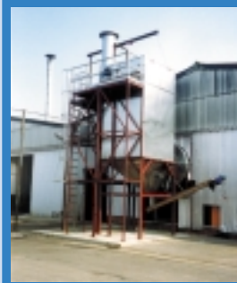
Stainless steel dust collector installation on rotary drum dryer in Nellinghof, Germany.