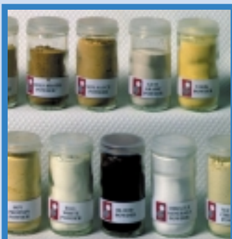
Cheese, milk and egg products are among the many powders produced on FES spray dryers.