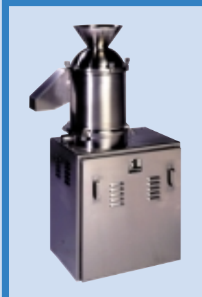
Basket centrifuge operates continuously to separate solids from liquid process stream.