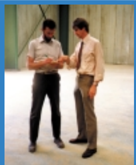
On-site training of production personnel during commissioning of egg products facility in Sao Paulo, Brazil.

Offices at the following locations: Corporate Offices - Glendora, California - USA Hong Kong • Brugge, Belgium Mumbai (Bombay), India