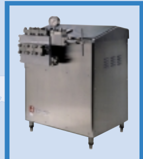
High pressure pumps and homogenizers used on FES spray dryers, UHT pasteurizers and membrane systems.