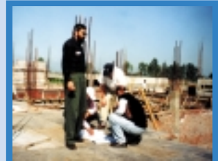
Field engineers inspect construction site in Chandigarh, India to check contractor's work with project drawings prepared by FES engineering office.